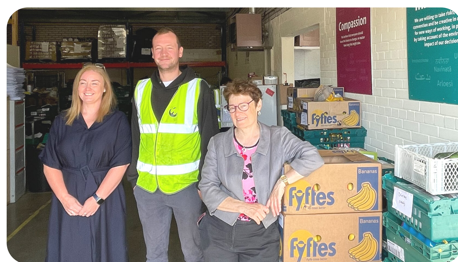
Visiting Cyrenians to learn about their work to tackle the causes and consequences of homelessness