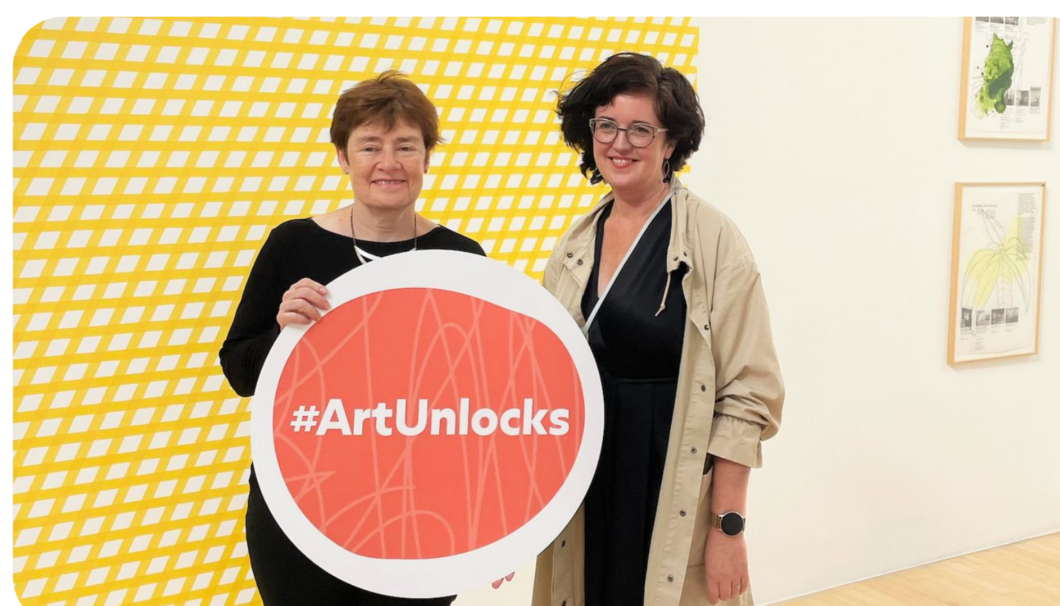
Visiting Talbot Rice as part of the Scottish Contemporary Art Network’s #ArtUnlocks campaign