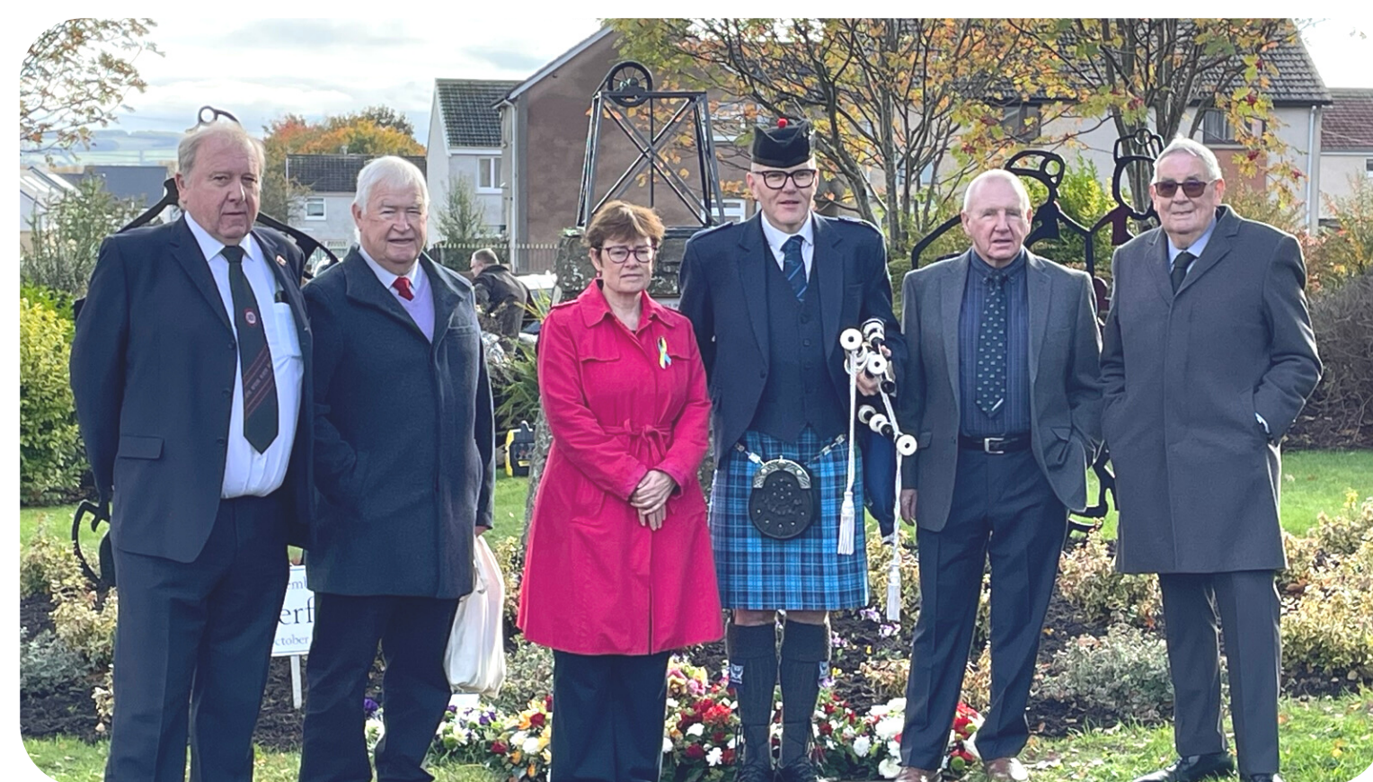
Taking part in the Danderhall Aberfan Memorial